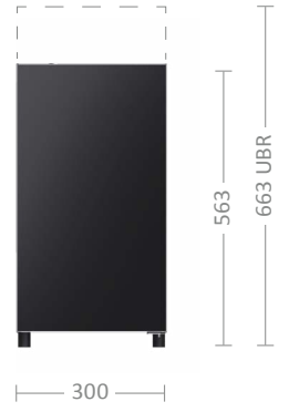
10l cooler R10 UBR (under-counter) 30 kg | 0.09 kW*