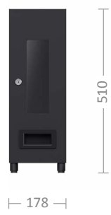
Aroma module A 16 kg