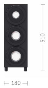
Cup dispenser CD 13 kg