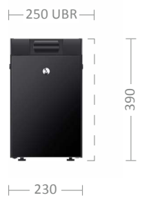
9l cooler L9 / L9 UBR (under-counter) 18 kg | 0.04 kW*