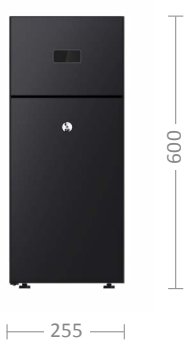
15l cooler L15 / L15 UBR (under-counter) 23 kg | 0.08 kW*