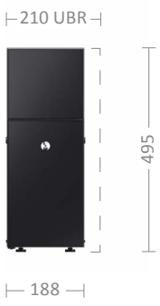
7l cooler L7 / L7 UBR (under-counter) 17 kg | 0.04 kW*