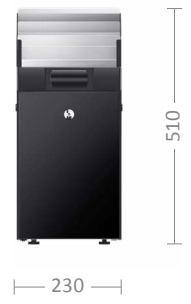
9l cooler L9s with dispenser 20 kg | 0.04 kW*