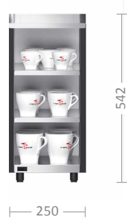
Cup warmer W 17 kg | 0.16 kW*