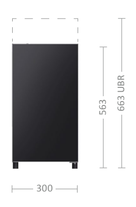
10l cooler R10 UBR (under-counter) 30 kg | 0.09 kW* 1 or 2 types of milk