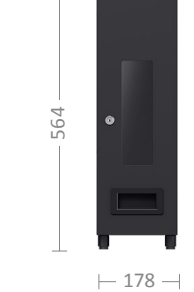
Aroma Module S300 | S500 A 18 kg