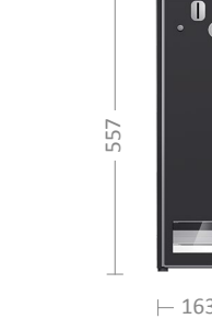
Coin Changer all Mynt casing / Mynt CC (with coin changer) 21 kg / 23 kg