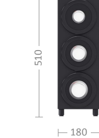
Cup Dispenser all CD 13 kg