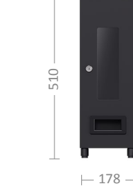
Aroma Module S1 | S2 | XM | XT A 16 kg