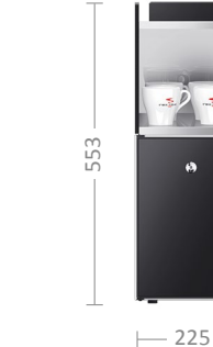
4l Cooler S300 L4v (with cup warmer) 21 kg | 0.12 kW 1)