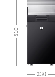
9l Cooler S1 | S2 | XM | XT L9s (with dispenser) 20 kg | 0.04 kW 1)