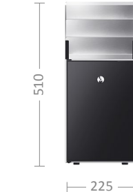
4l Cooler S1 | S2 L4s (with dispenser) 18 kg | 0.04 kW 1)