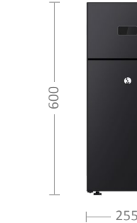
15l Cooler S300 | S500 | XM | XT L15 / L15 UBR (under-counter) 23 kg | 0.08 kW 1)