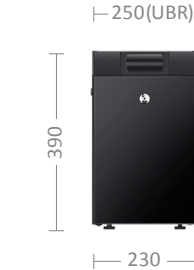
9l Cooler all L9 / L9 UBR (under-counter) 18 kg | 0.04 kW 1)