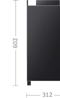
10l Cooler S300 | S500 R10 30 kg | 0.09 kW 1)