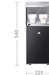
4l Cooler S1 | S2 L4v (with cup warmer) 21 kg | 0.12 kW 1)