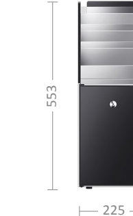
4l Cooler S300 L4s (with dispenser) 18 kg | 0.04 kW 1)