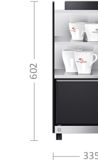
4l Cooler S300 | S500 Fh4 (with cup warmer) 25 kg | 0.3 kW 1)