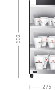
Cup Warmer S300 | S500 W 12 kg | 0.2 kW 1)