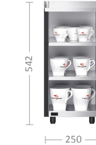
Cup Warmer S1 | S2 | XM | XT W 17 kg | 0.16 kW 1)