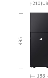
7l Cooler all L7 / L7 UBR (under-counter) 17 kg | 0.04 kW 1)