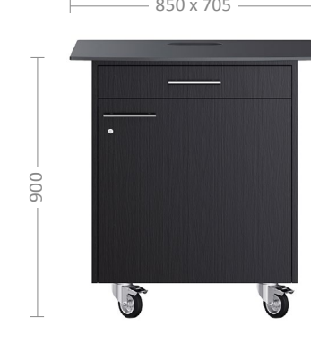
Mobile Cart all Water Self Supply | Pump | Filter 54 kg