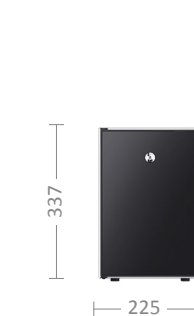
4l Cooler S1 | S2 | S300 L4 14 kg | 0.04 kW 1)