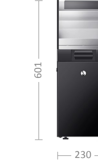
9l Cooler S300 | S500 L9s (with dispenser) 21 kg | 0.04 kW 1)